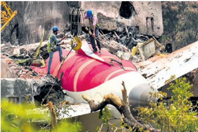
IN ONE OF THE WORST AIRCRAFT ACCIDENTS IN INDIA, A TOTAL OF 260 PEOPLE, INCLUDING 241 PASSENGERS, DIED AFTER AIR INDIA'S BOEING 787-8 AIRCRAFT OPERATING FLIGHT AI171 TO LONDON GATWICK CRASHED SOON AFTER TAKE OFF FROM AHMEDABAD JUNE 12

Agency New Delhi, Oct 7: Civil Aviation Minister K Rammo-han Naidu Tuesday said there is "no manipulation or dirty business" happening in the investigation into the Air India plane crash that killed 260 people June 12. His assertion comes against the backdrop of concerns expressed in certain quarters about the Aircraft Accident Investigation Bureau (AAIB) probe into the fatal crash. Naidu said everyone has to wait for the final AAIB's final probe report to know what exactly happened. "There is no manipulation, or there is no dirty business, hap-pening in the investigation. It is a very clean and very thorough process that we are doing ac-cording to the rules...," he said. The minister also said it will take some time for the fi-nal AAIB report into the crash and added, "We don't want to pressure them into coming up with some history report". He was speaking on the side-lines of a book launch function in the national capital. In one of the worst aircraft accidents in India, a total of 260 people, including 241 pas-sengers, died after Air India's Boeing 787-8 aircraft operating flight AI171 to London Gatwick crashed soon after take off from Ahmedabad June 12. AAIB, in its preliminary re-port released July 12, had said the fuel supply to both engines of the plane was cut off within a gap of one second, causing confusion in the cockpit soon after takeoff. "In the cockpit voice record-ing, one of the pilots is heard asking the other why did he cut