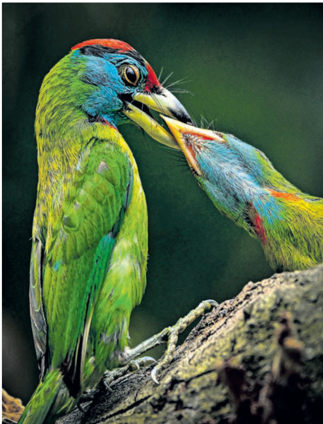
A Blue-throated barbet feeds its chick, in Nadia, West Bengal