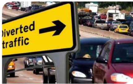
Chhatrapati Shivaji Maharaj Chowk.

Traffic will also be restricted from the T-point near Jeevanjyoti Hospital towards