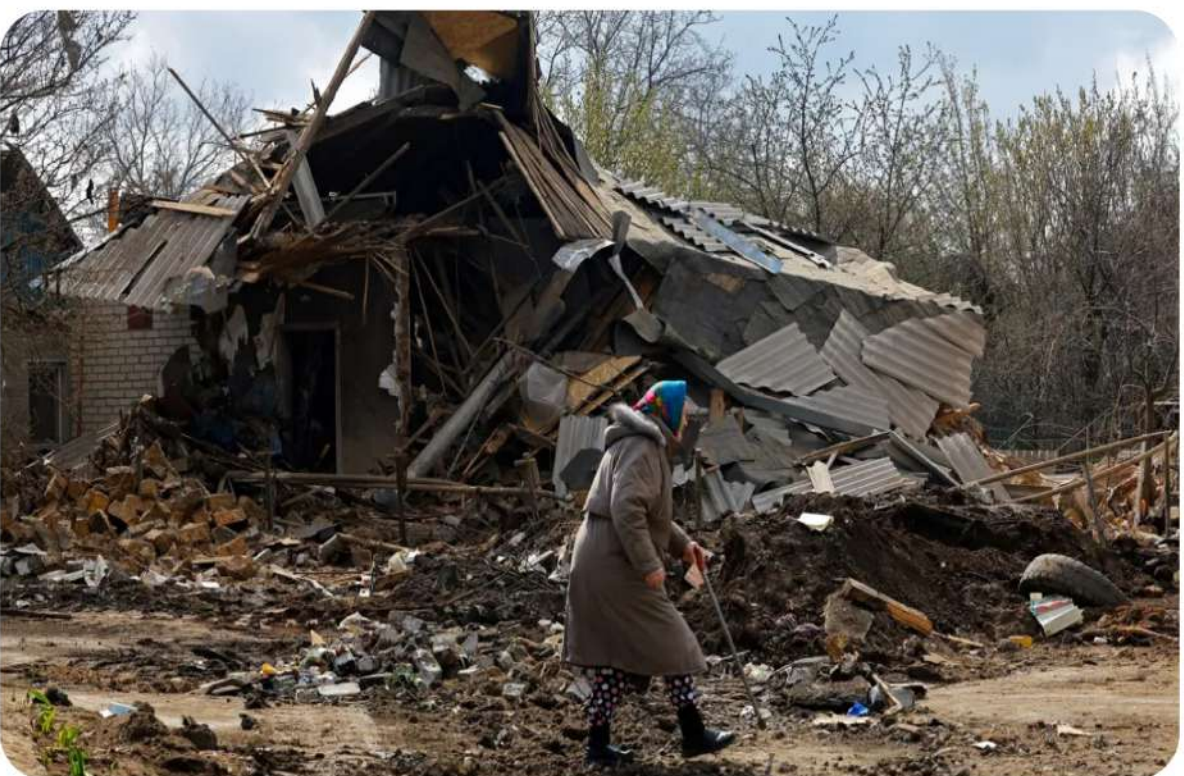
Ukraine and Russia accuse each other of hundreds of ceasefire violations