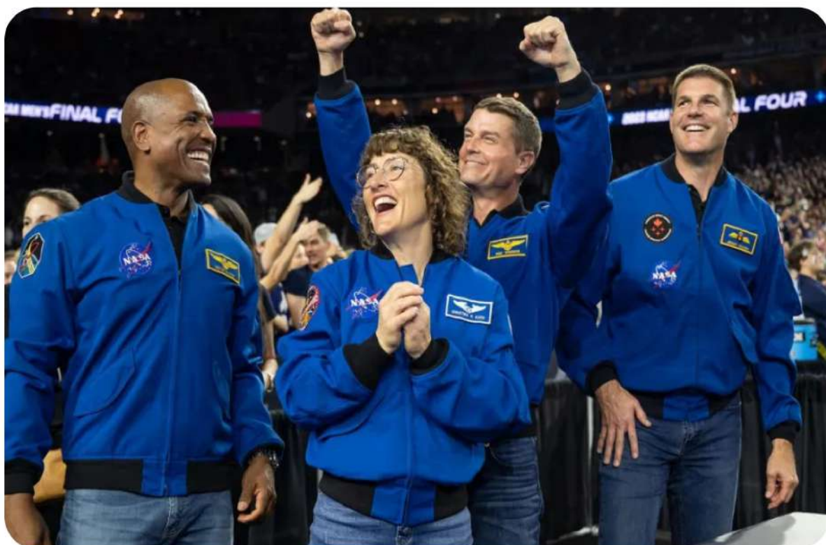
Artemis II crew said they are going to the Moon

influence, credibility, and protection across borders for so long". Khanna said a meeting with survivors would give an opportunity to "identify any additional information British institutions and individuals may be able to share". He added: "It would also ensure that survivors are heard directly and that these matters are addressed with transparency, seriousness, and accountability." The California lawmaker also noted that members of Congress have sought testimony from the King's brother, Andrew Mountbatten-Windsor, as well as Peter Mandelson, the UK's former ambassador to the US, about their ties to Epstein. Mountbatten-Windsor, who was stripped of his titles last year due to his ties with Epstein, cannot be forced by a subpoena to go to the US. In his letter, Khanna said the former prince "did not respond" when Congress members sought testimony from him regarding his ties to the disgraced financier. Mountbatten-Windsor has consistently and strenuously denied any wrongdoing in his associations with Epstein. Mandelson, Khanna wrote, was asked to appear before a committee on the same matter.