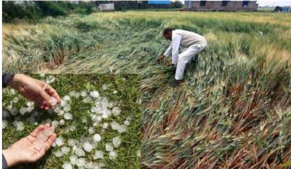
Parbhani, Beed, Hingoli, Pune, Solapur, Satara, and Sangli.

MAHARASHTRA : The India Meteorological Department (IMD) has issued a weather advisory for Maharashtra from March 31 to April 3, 2026, warning of unstable conditions across the state, including thunderstorms, lightning, strong winds, hailstorms, and light to moderate rainfall. Western Maharashtra, Marathwada, Vidarbha, and parts of Konkan are expected to be most affected, with wind speeds potentially reaching 30-60 km/h in some areas. Certain regions are at higher risk of hail damage. March 31 - Orange Alert : Severe thunderstorms with hail, lightning, heavy winds, and rainfall expected in Nashik, Jalgaon, Ahmednagar, Chhatrapati Sambhajnagar, Jalna,